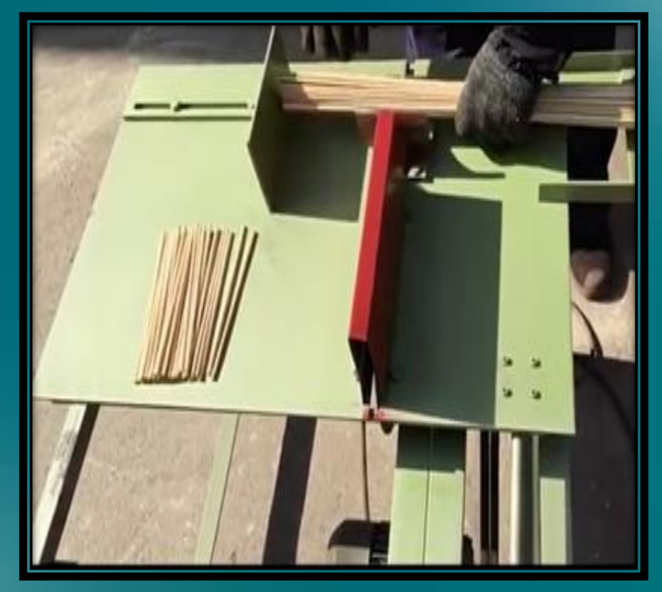
Size Cutting Machine