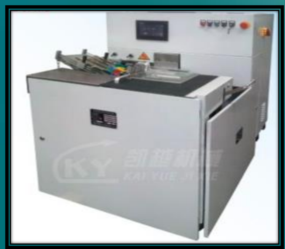
Toothbrush Tufting Machine